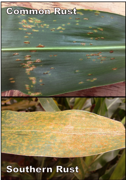
Comparison of common and southern rust

Similar to southern rust, common rust does not overwinter in the Midwest, but arrives from spores that are carried north on storms from the southern United States. Common rust is not as aggressive as southern rust and poses less risk of yield loss. Therefore, distinguishing between the two rust species is important for management considerations.