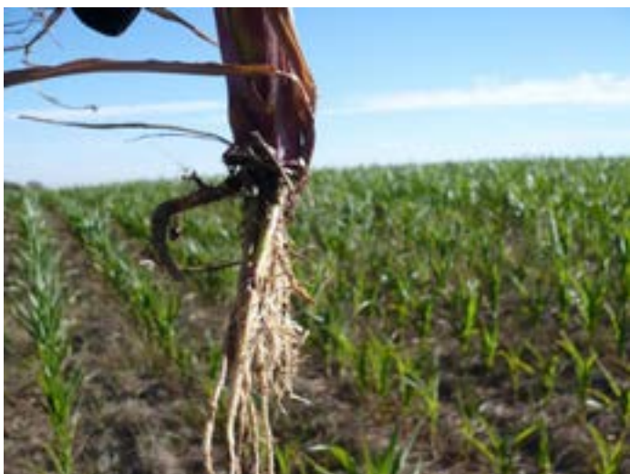
Restricted root development due to sidewall compaction from wet/muddy planting conditions.