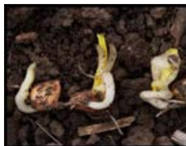
Corkscrew germination can result from imbibitional seed chilling

germinate. It is critical this occurs without major fluctuations in soil water temperature. A cold rain or rapid cooling of soil water can lead to imbibitional seed chilling which can cause corkscrew seedlings or other seedling